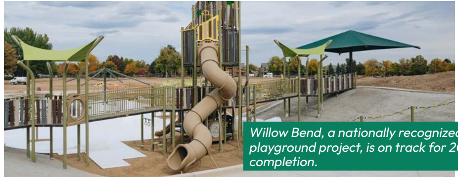
Willow Bend, a nationally recognized playground project, is on track for 2025 completion.