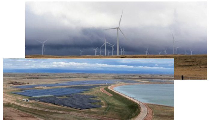
Wind turbines at Roundhouse Renewable Energy Project near Granite, Wyoming, and the Rawhide Flats solar field north of Wellington, Colorado, photographed in April 2023 — both locations are part of Platte River Power Authority's renewable energy generation.

Achieving 100% renewable energy requires ongoing collaboration between utilities, policymakers and the public. As we continue into 2024, look for updates from us about how our transition to renewable energy will shape our operations — including a re-launch of our rooftop solar program later this year. You can read more about Platte River Power Authority's transition to renewable energy at prpa.org/2024irp .