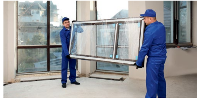
Window upgrades can improve energy efficiency.

Qualifying CARE participants receive a home assessment evaluating eligibility for upgrades like air sealing and insulation, LED lighting, HVAC upgrades, window replacement and appliance upgrades. Homeowners or renters can apply (renters must include a landlord waiver in their application). Customer incomes must be at or below 80% of the area's median income; participation in other income-qualified programs such as SNAP, WIC, Old Age Pension and LEAP (utility bill assistance) can automatically qualify customers.