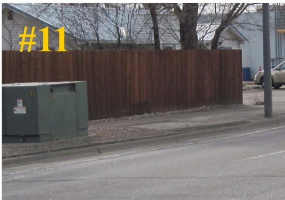
Tart From the Heart Anne Thouthip Location to be approved

29th Street and Taft Avenue, north side of street