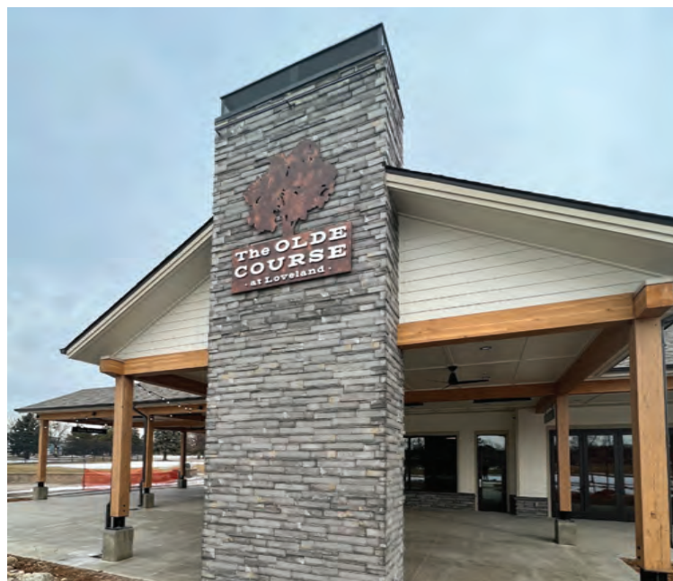
The original 63-year-old clubhouse at the Old Course at Loveland golf course (pictured below left) has been replaced with a new facility, complete with an expanded outdoor section and grand entrance (pictured above.)

The new pro shop is sleek, modern and ready to serve customers.