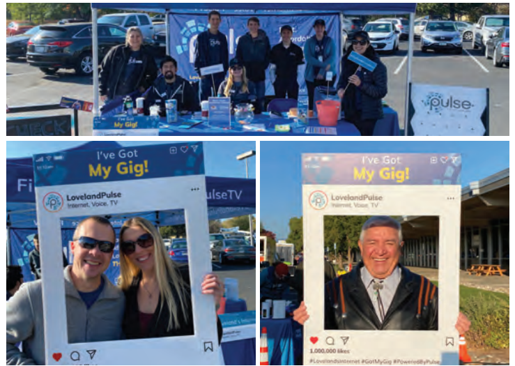
Dozens of happy Loveland Pulse customers visited our booth at the 60 Years of Seeds of Innovation Event at The Forge campus on October 8, 2022.

With 2023 around the corner, we're getting excited as Phase 1 of the construction project is entering the home stretch. We are also working on new features, tools, and processes to keep delivering on our promises of incredible service to the community (current Pulse customers, you'll want to keep a close eye on upcoming announcements!). If you haven't already, check to see if your address is in a Pulse-ready area now, and keep in touch with us for news, updates, and feature launches at LovelandPulse.com/CheckAvailability