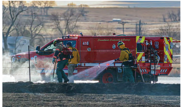
Loveland Fire Rescue Authority firefighters put out a fire in the area.

The LFRA will host an Open House and Wildfire Awareness Program at Station 7, 2629 N. County Road 27, from 11 a.m. – 3 p.m. on May 21. LFRA and its regional response partners will offer detailed information on wildfire prevention and preparedness. No registration is required.