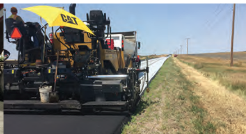
Mill and Overlay - Asphalt Paving