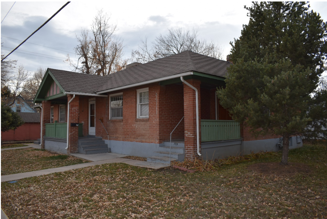
CD 1, Image 153, View to Southwest