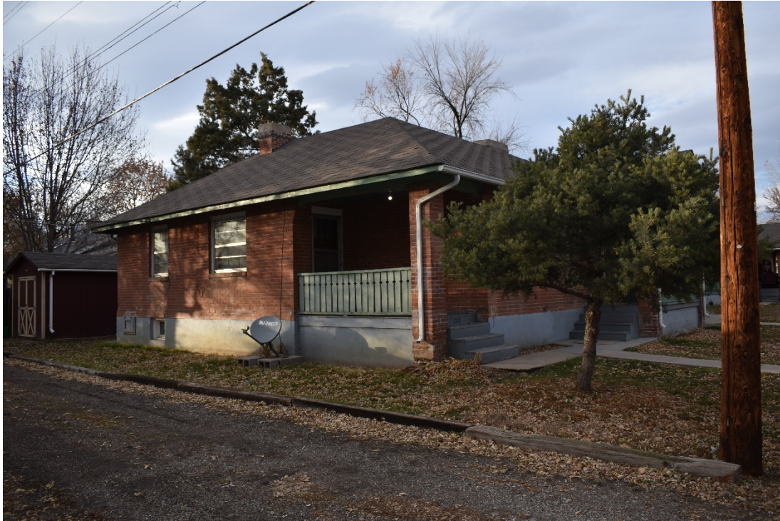
CD 1, Image 154, View to Northwest