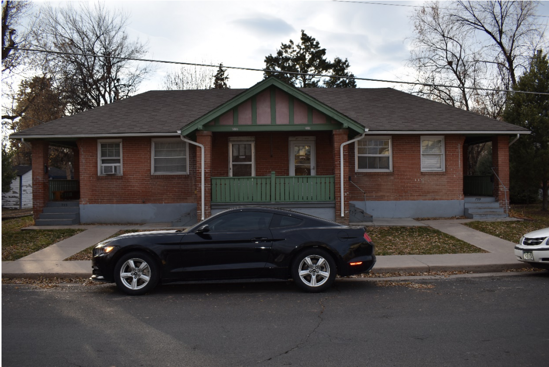
CD 1, Image 152, View to West