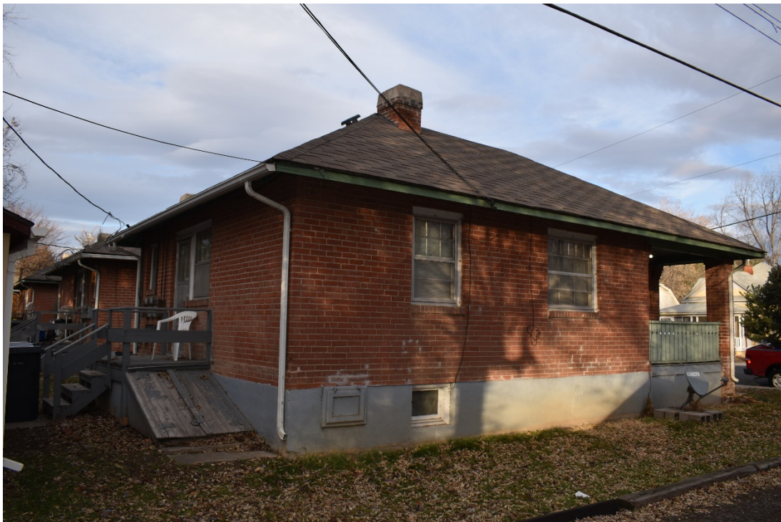
CD 1, Image 155, View to Northeast