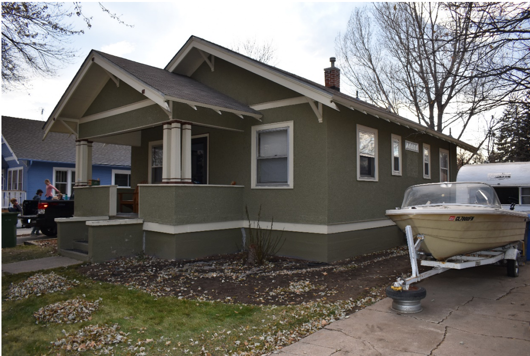
CD 1, Image 175, View to Southwest, of the dwelling