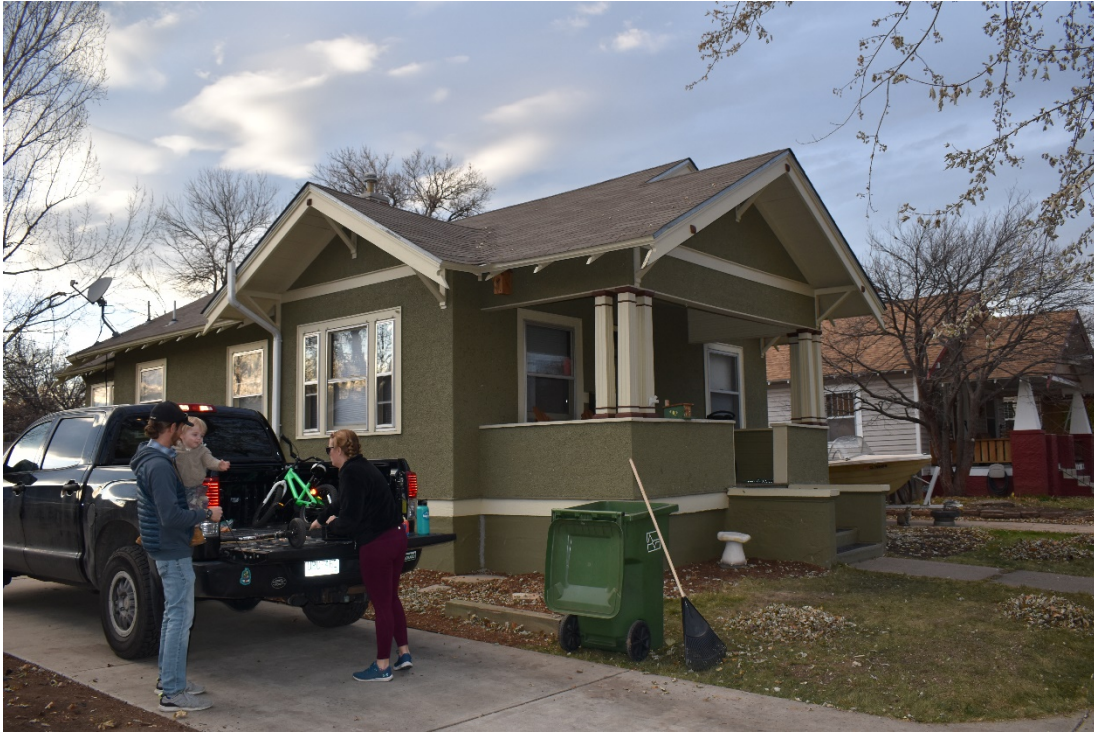
CD 1, Image 176, View to Northwest, of the dwelling