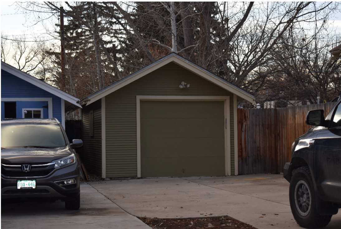
CD 1, Image 177, View to West, of the garage