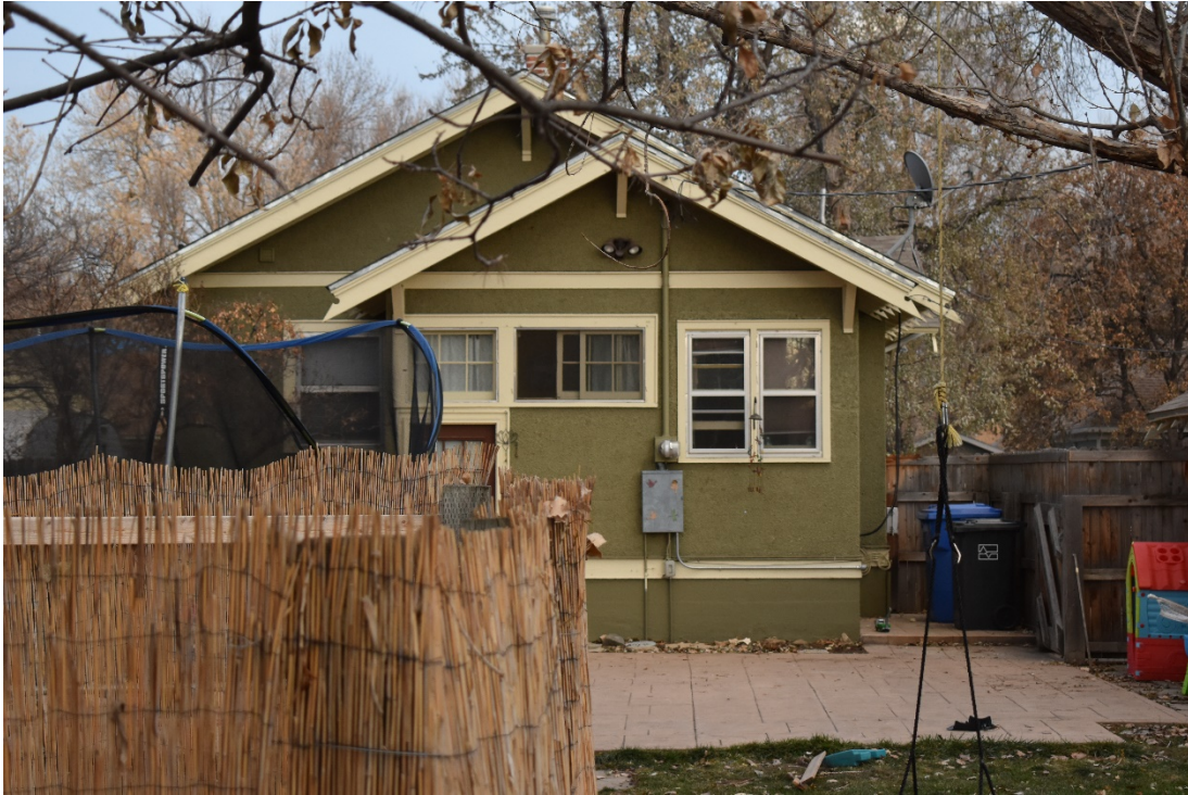
CD 1, Image 178, View to East, of the dwelling