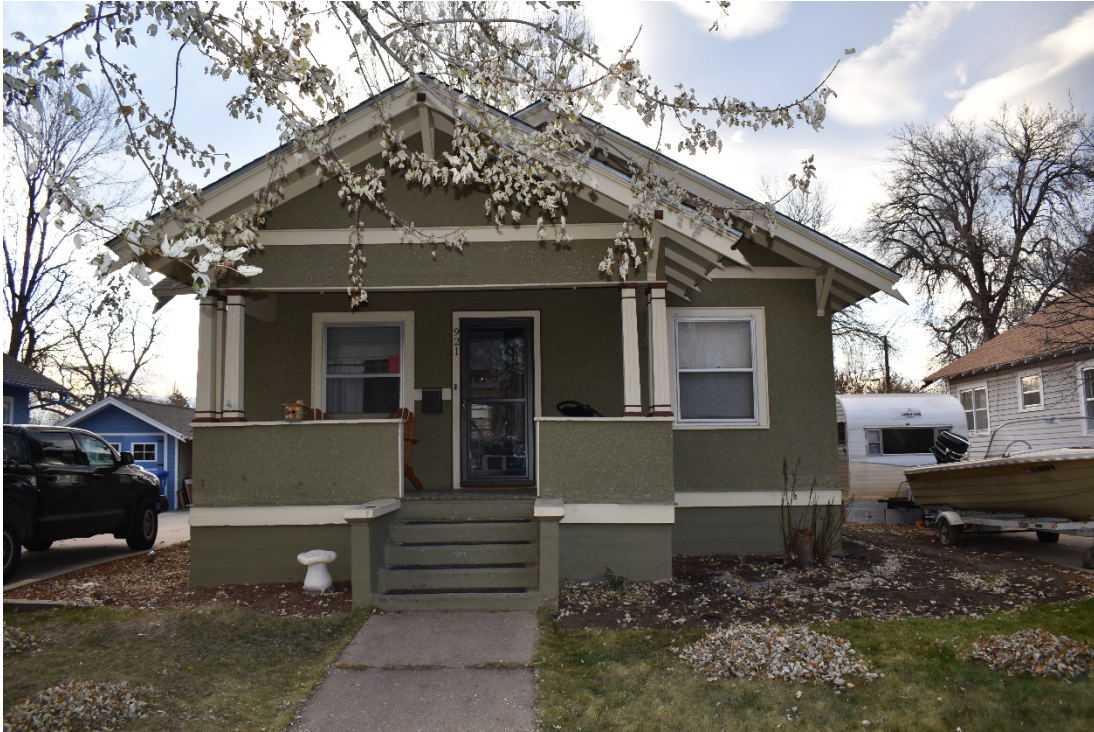
CD 1, Image 174, View to the West, of the dwelling