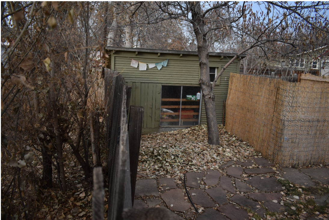
CD 1, Image 179, View to North, of the shed