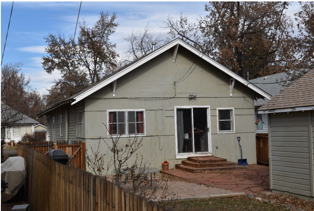
CD 1, Image 99, View to North-northeast, primarily of the dwelling