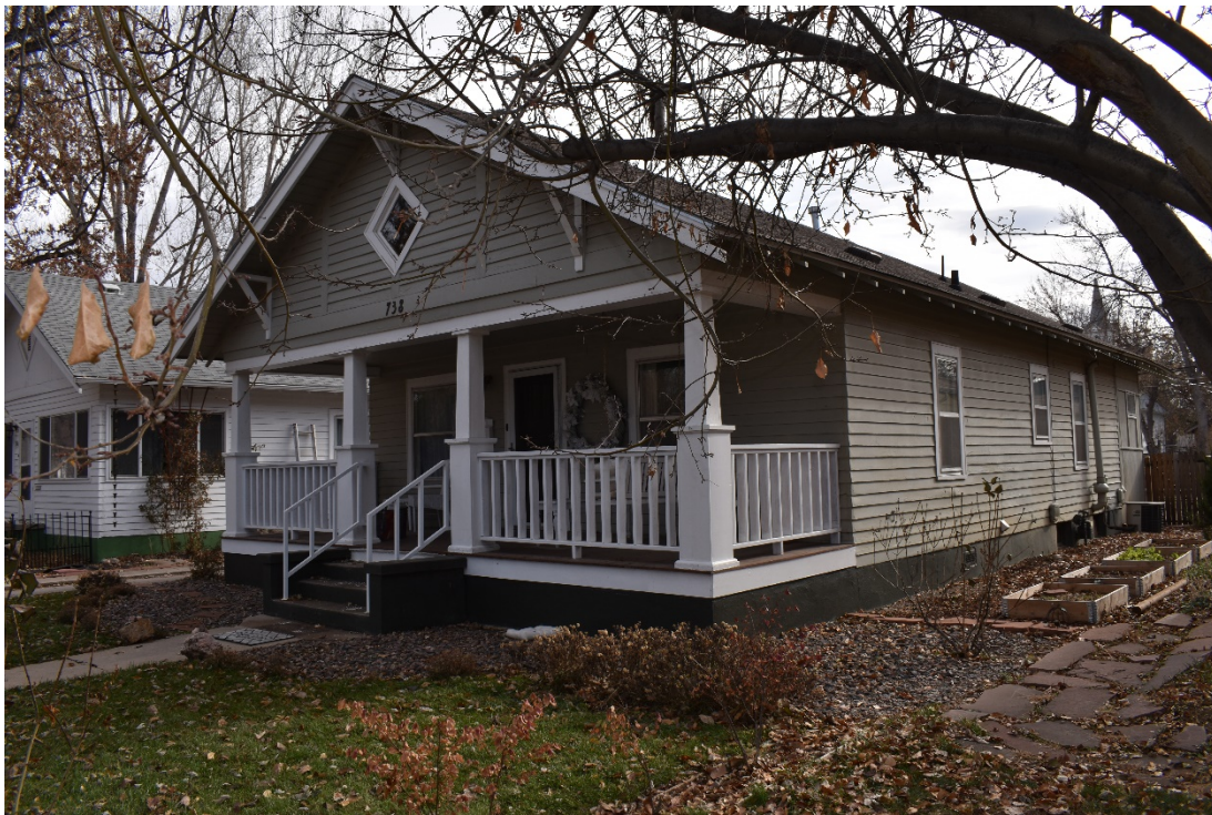
CD 1, Image 97, View to Southeast, of the dwelling