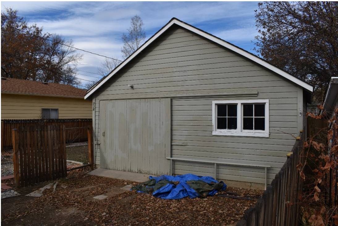
CD 1, Image 101, View to South-southwest, of the garage