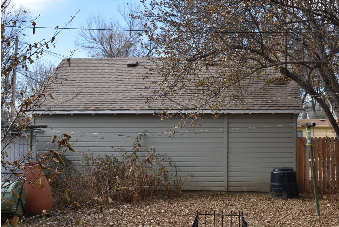
CD 1, Image 102, View to West, of the garage