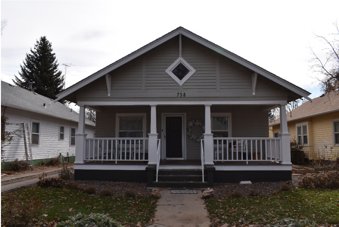
CD 1, Image 96, View to South, of the dwelling