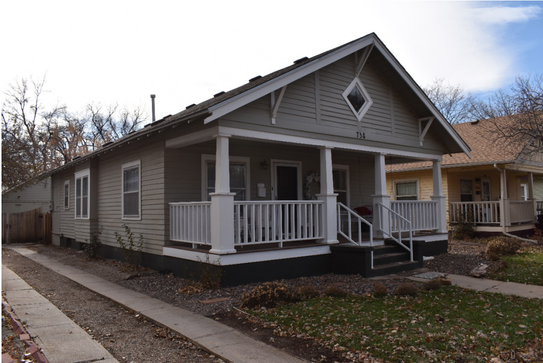
CD 1, Image 98, View to Southwest, of the dwelling