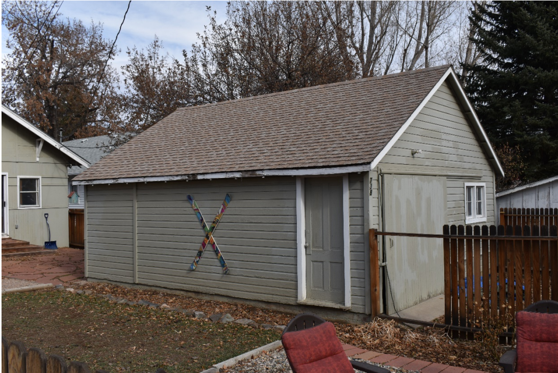
CD 1, Image 100, View to Northeast, of the garage