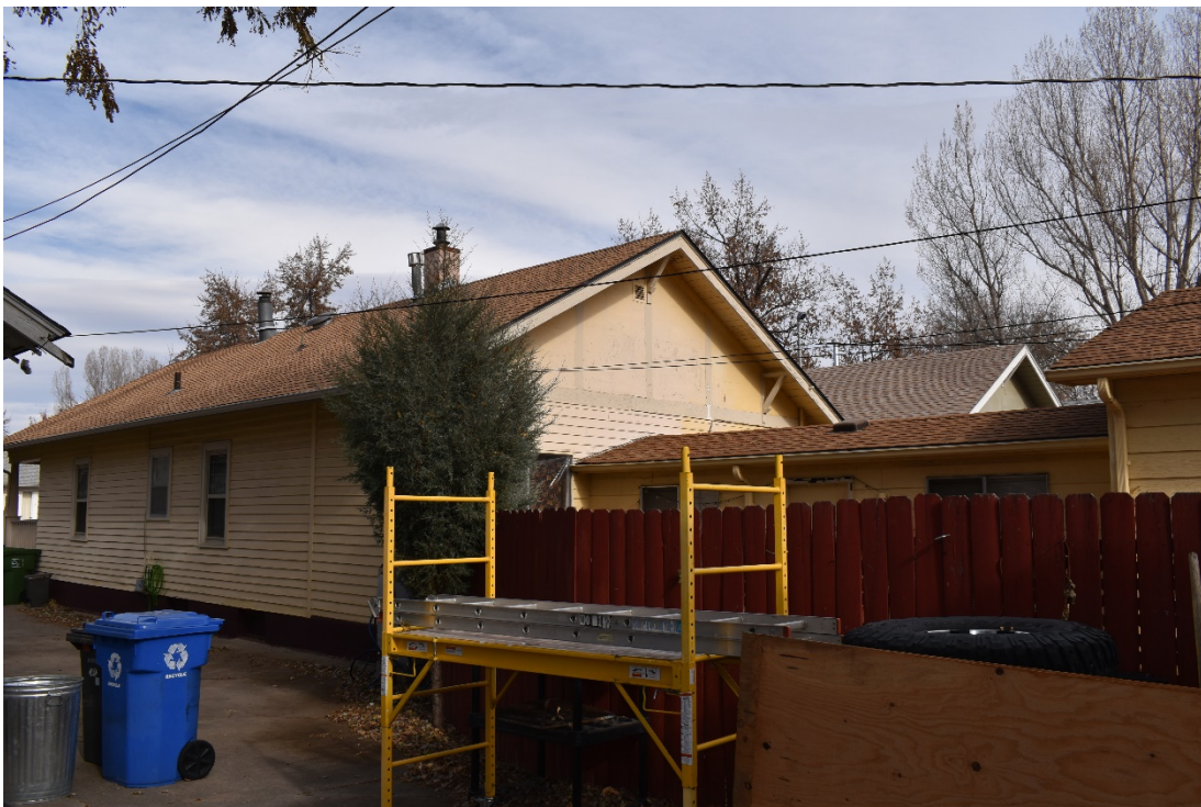
CD 1, Image 92, View to Northeast, of the dwelling and of the connecting addition