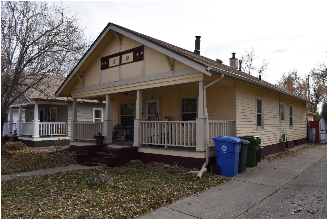
CD 1, Image 90, View to Southeast, of the dwelling