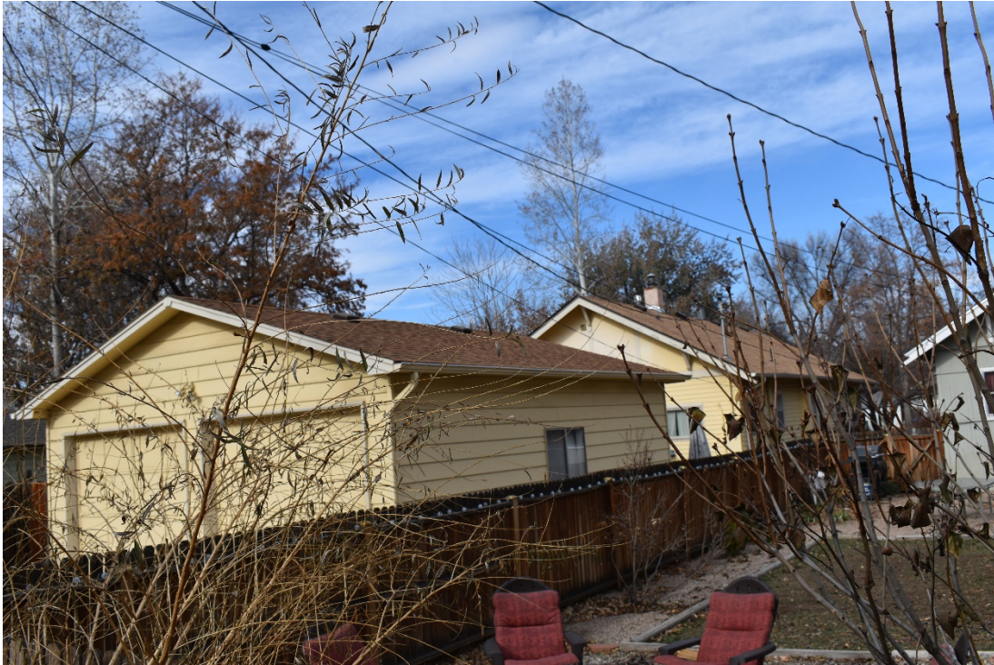
CD 1, Image 95, View to Northwest, of the garage and dwelling