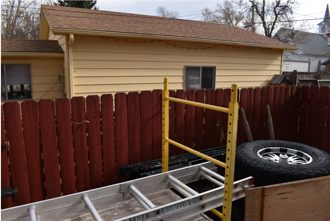
CD 1, Image 93, View to East-Southeast, of the garage and connecting addition