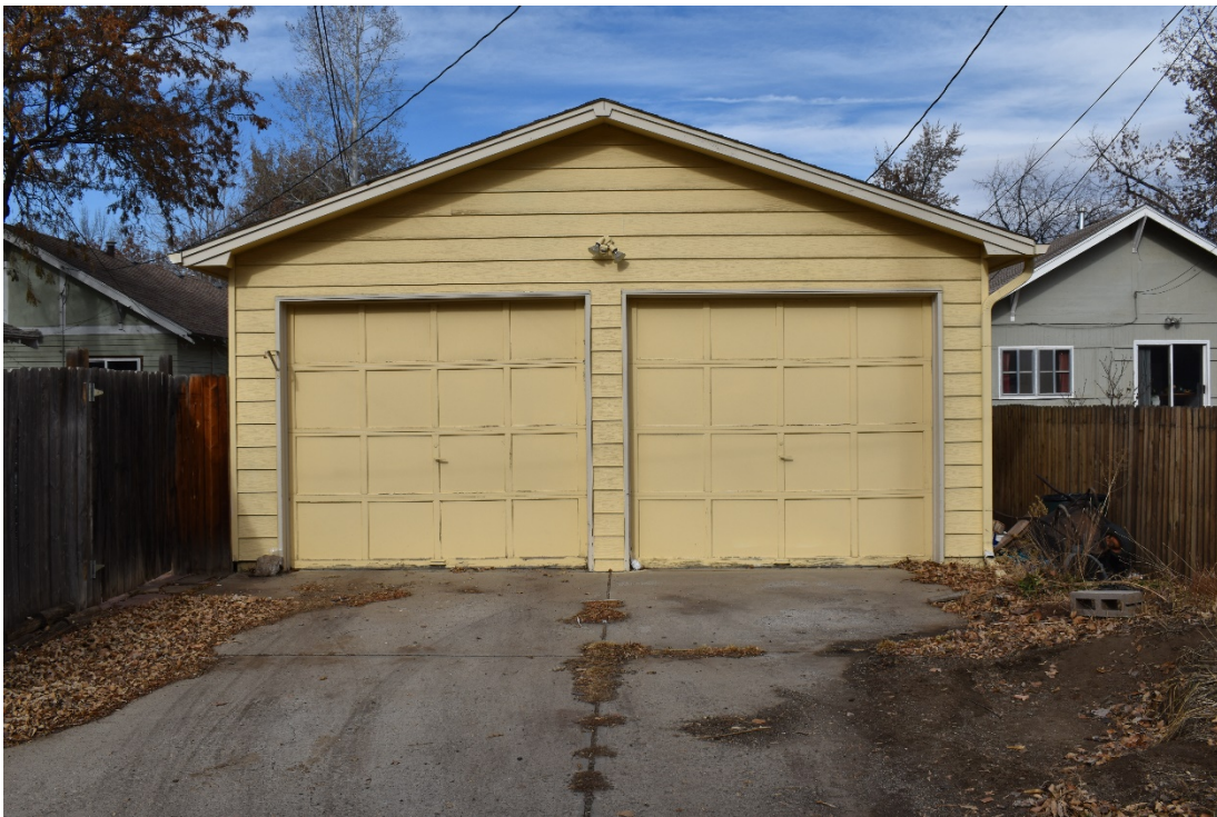
CD 1, Image 94, View to North, of the garage