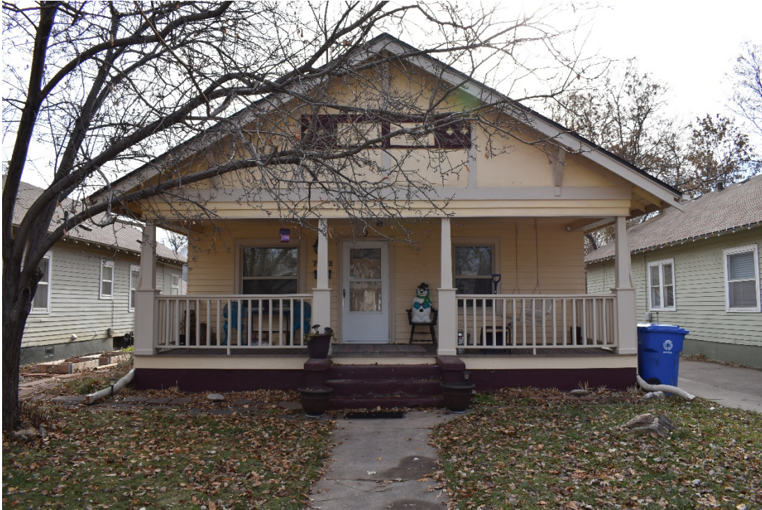
CD 1, Image 89, View to South, of the dwelling