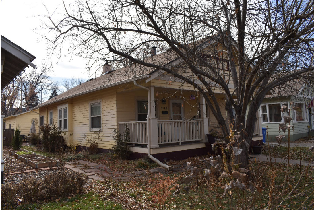
CD 1, Image 91, View to Southwest, of the dwelling