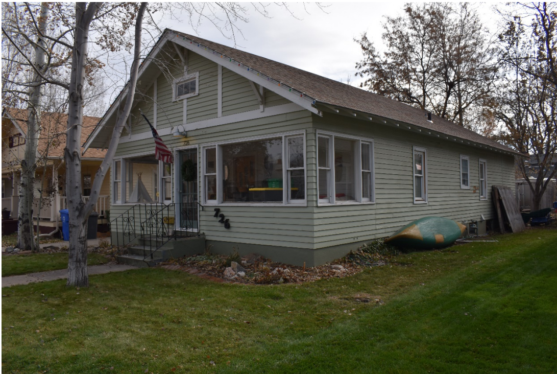
CD 1, Image 83, View to Southeast, of the dwelling