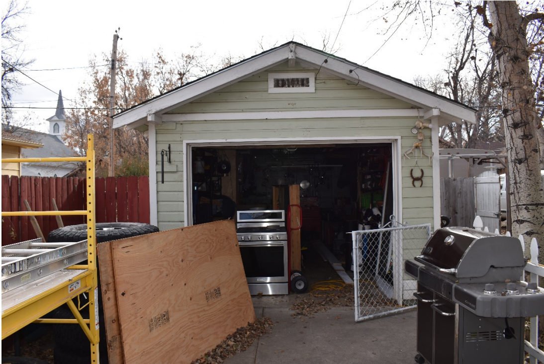
CD 1, Image 86, View to South, of the garage