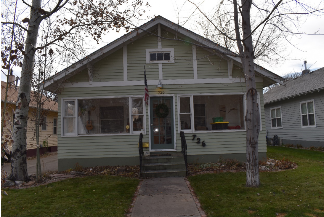
CD 1, Image 82, View to South, of the dwelling