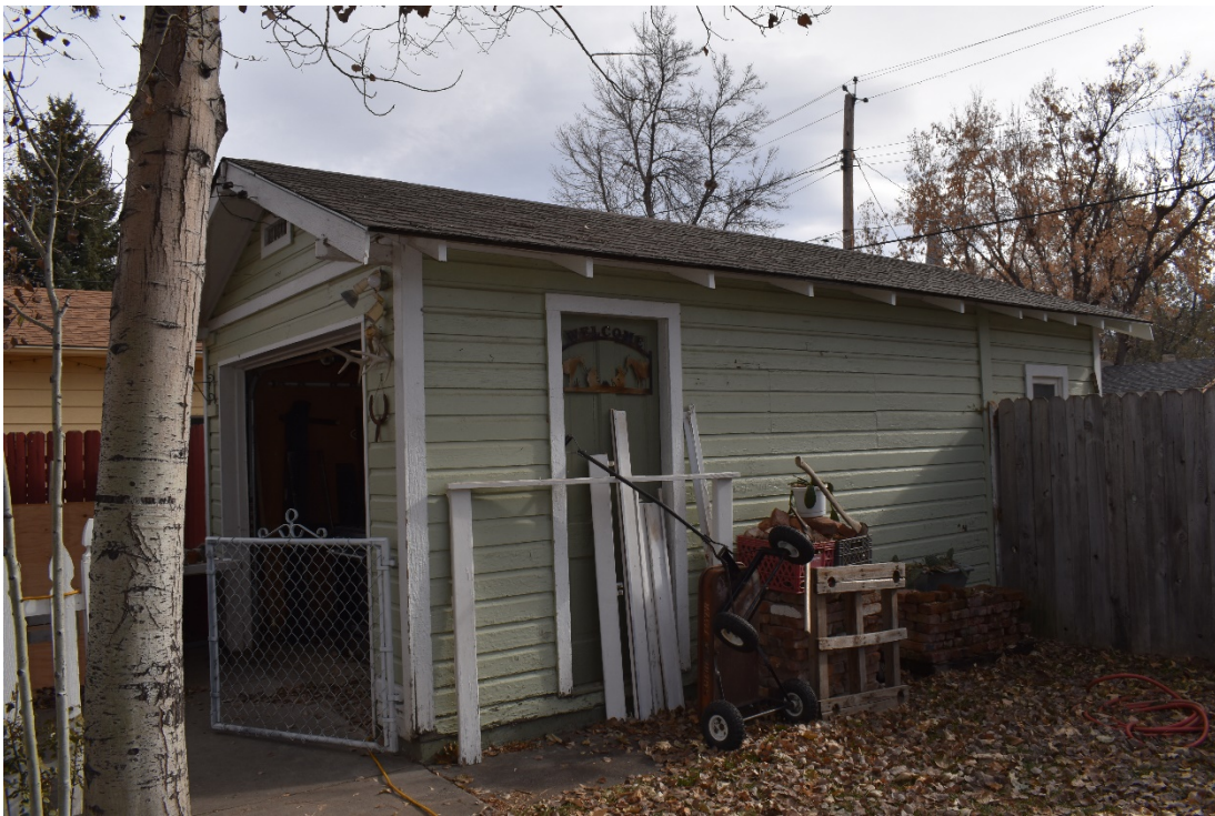
CD 1, Image 87, View to Southeast, of the garage