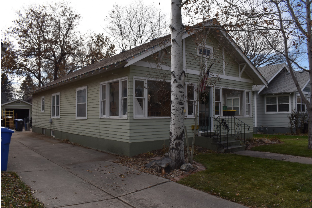
CD 1, Image 84, View to Southwest, of the dwelling