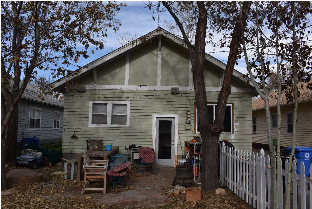
CD 1, Image 85, View to North, of the dwelling