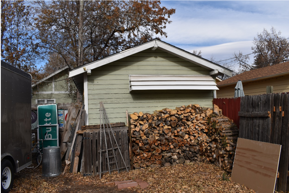
CD 1, Image 88, View to North, of the garage