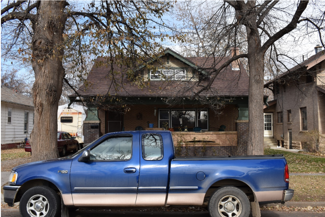
CD 1, Image 63, View to North, of the dwelling