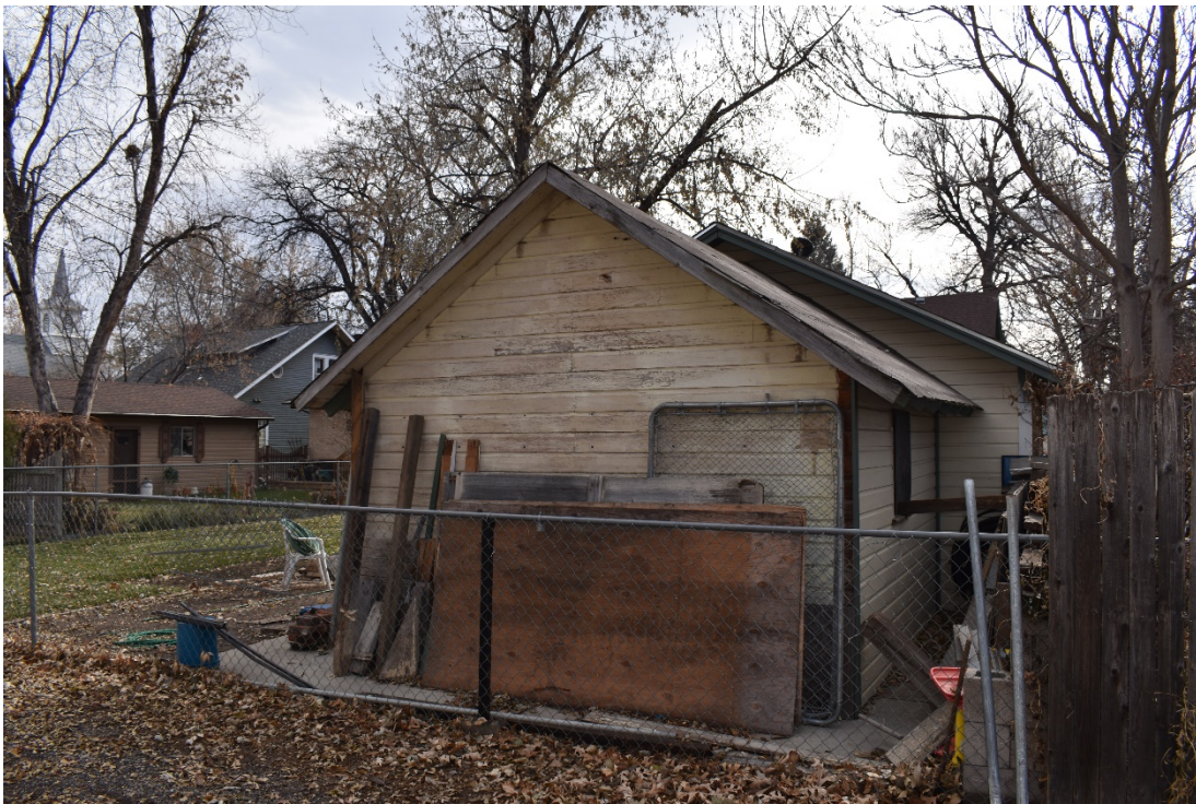
CD 1, Image 68, View to South-Southeast, of the garage and shed