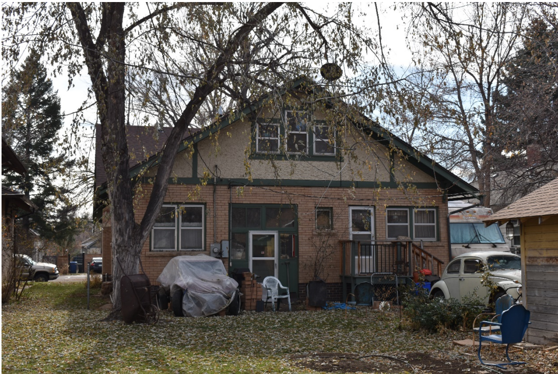
CD 1, Image 66, View to South, of the dwelling