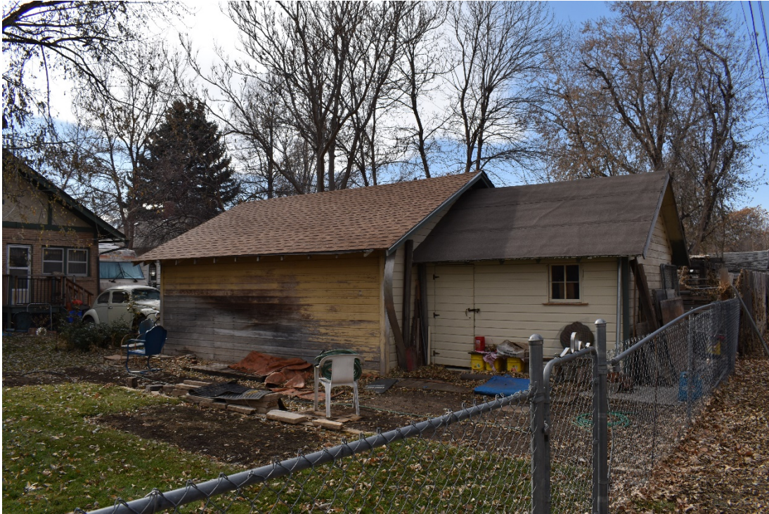
CD 1, Image 67, View to West-Southwest, of the garage and shed