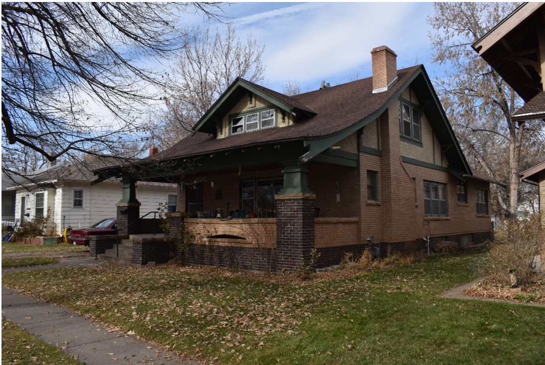
CD 1, Image 64, View to Northwest, of the dwelling