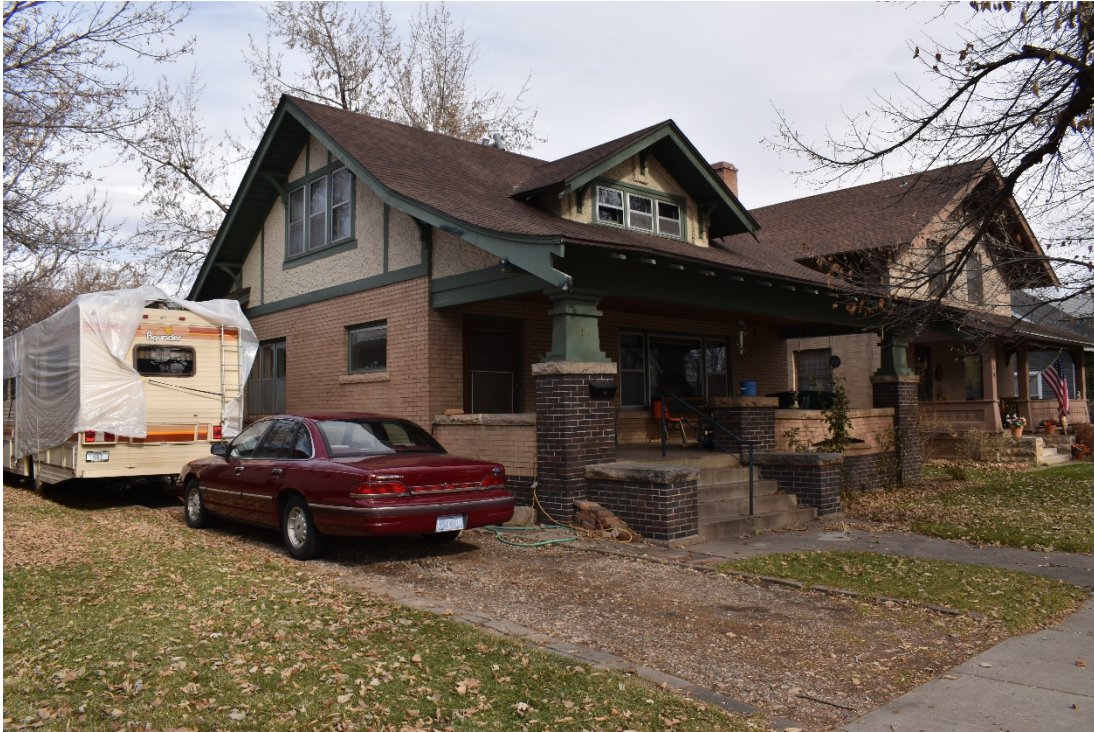
CD 1, Image 65, View to Northeast, of the dwelling