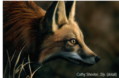
Cathy Sheeler, Sly , (detail)