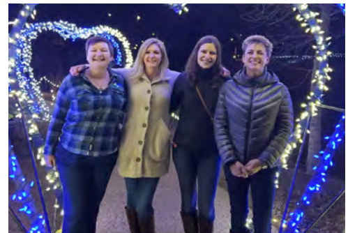
2019 – LWP'S CUSTOMER RELATIONS DIVISION

(Electric Distribution Designer – Eight months with LWP)