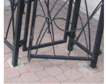
Figure 6. Railing installed in sleeves