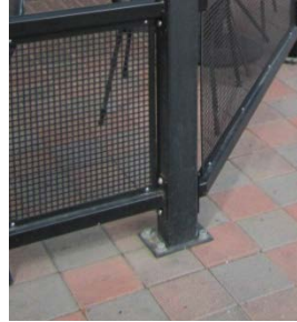
Figure 5. Bolted railing

Railings may also be bolted to the sidewalk or installed in sleeves in the sidewalk. However, it is preferable to have railing enclosures with the flexibility to be temporarily moved. The location of sleeves must be coordinated with existing utilities prior to installation. Sleeves must be filled or plugged in a manner as to not cause a trip hazard when posts are removed.