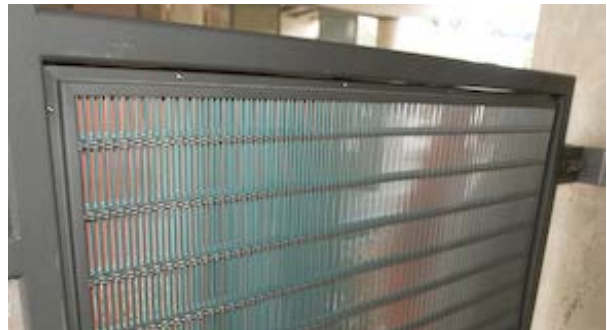
Figure 7: Unacceptable 50 percent open appearance

“Open” Appearance: Railings must be at least 50 percent open (see-through) in order to maintain the visual permeability of the streetscape.