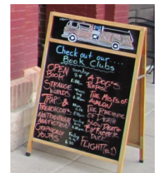
Figure 3. A-frame sign

A-frame signs are allowed in the permitted encroachment area, but must not exceed 6 square feet and must have a maximum height of 4 feet (Section 18.50.070.D.1e of the Loveland Municipal Code). Placement of A-Frame signs must maintain adequate circulation flow.