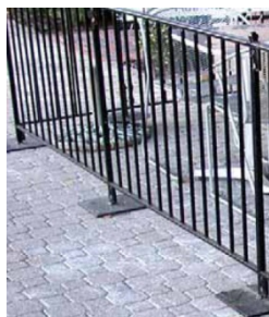
Figure 4. Sectional railing

A variety of styles and designs are acceptable for railing enclosures. Sectional railing (rigid fence segments that can be placed together to create a unified fencing appearance) is a desirable solution for outdoor seating areas as they are portable, but cannot be easily shifted by patrons or pedestrians.