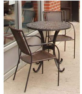
Figure 1. High quality furniture

All furniture and fixtures such as tables and chairs must be of high quality, durable and attractive, and must be consistent in color, style and type. Furniture should be commercial grade and manufactured for outdoor use.