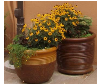
Figure 2. Planters are encouraged

Planters are encouraged to provide visual interest and create a more attractive and welcoming atmosphere. All planters must have plants contained within them. If the