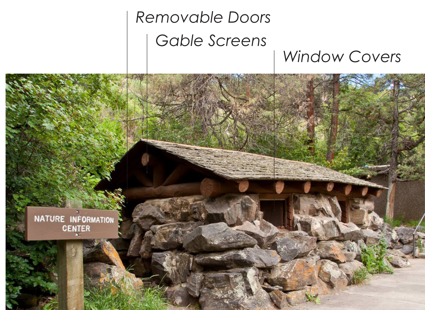
CCC-Era Butterfly Pavilion

Modifications are being planned to historic buildings to improve security, ADA accessibility and safety. Because the structures are historically significant, the City is coordinating design development with the State Historic Preservation Office. Improvements will require custom fabrication and installation. Expected completion is Spring 2020.