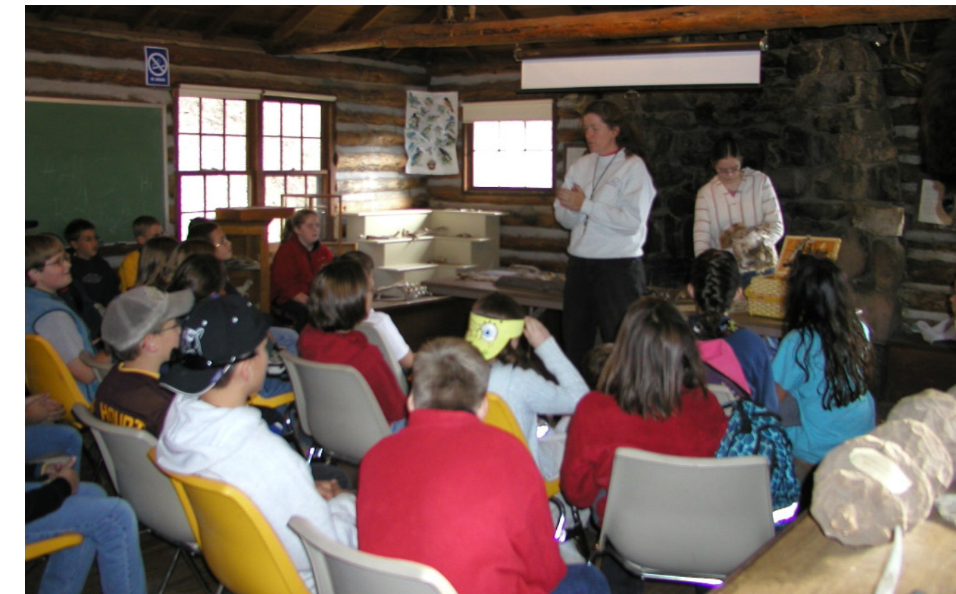
Environmental Education in the CCC-Era Historic Cabin