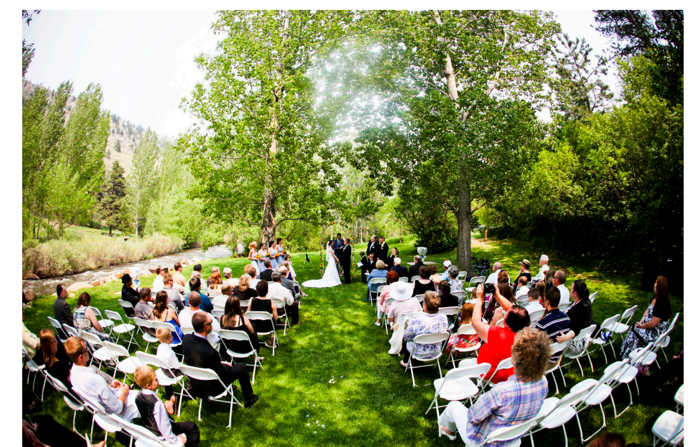
Wedding at VSMP