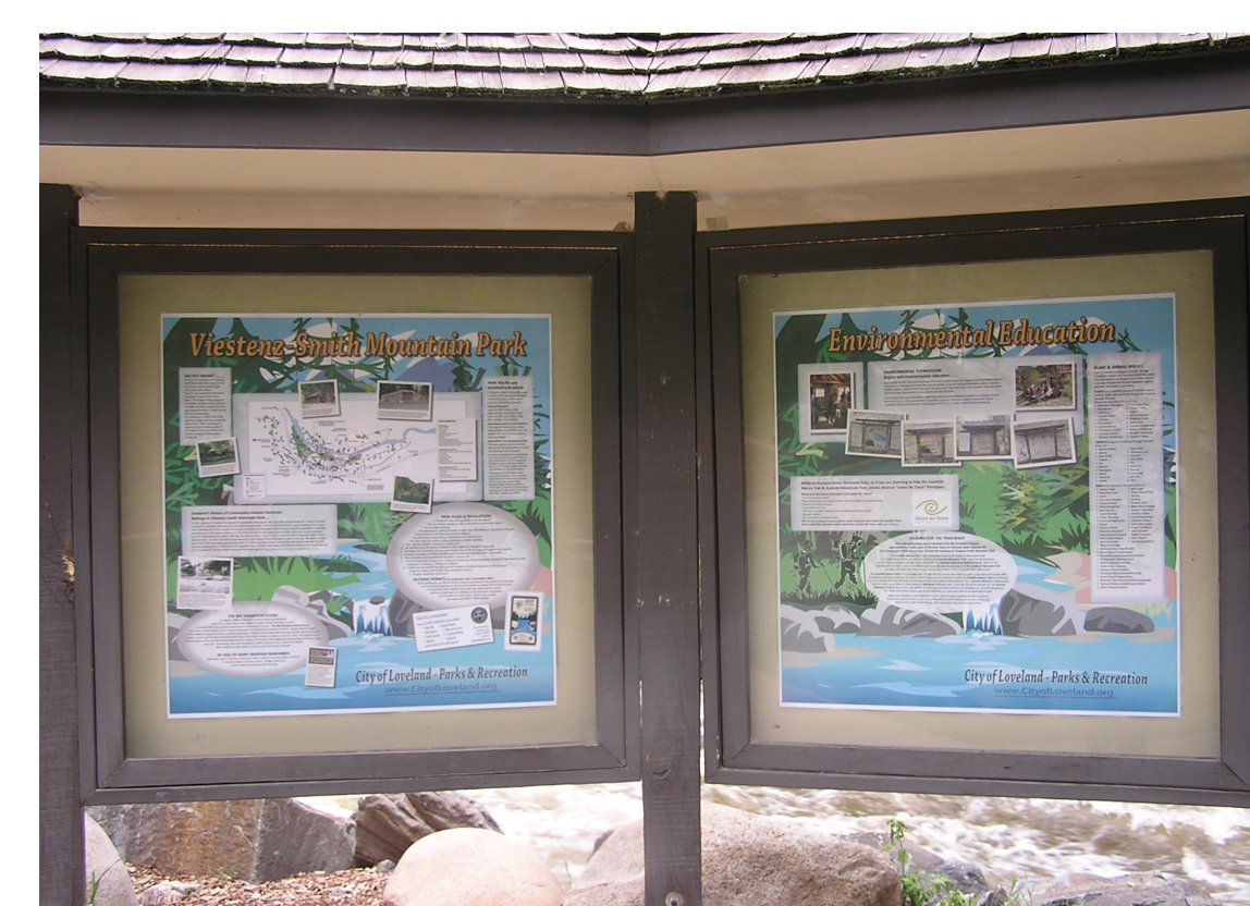
Pre-Flood Informational Kiosk with Park Rules and Regulations