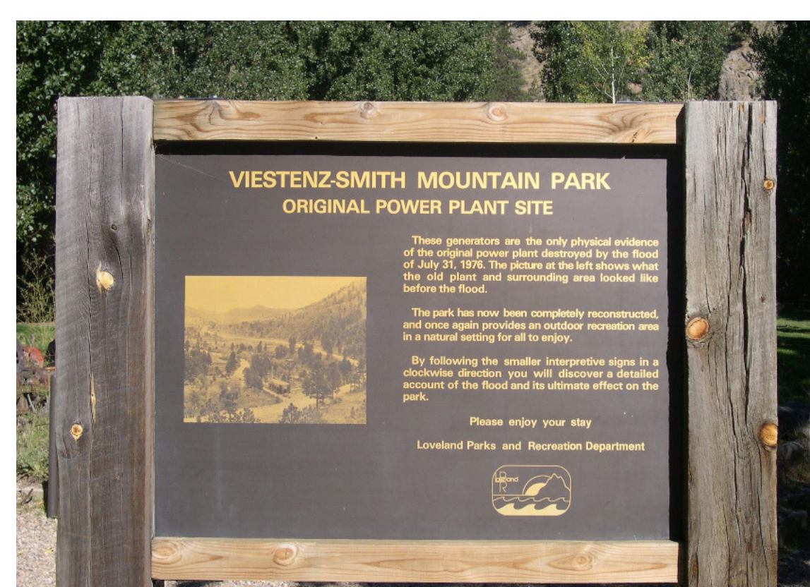
Pre-Flood Sign Highlighting Significance of Power Plant Site

Prior to the 2013 Flood, VSMP housed an array of interpretive signs with varying styles. The City will develop a sign plan that tells the story of the park through cohesive messaging and sign design. The sign plan is scheduled for completion in 2020.