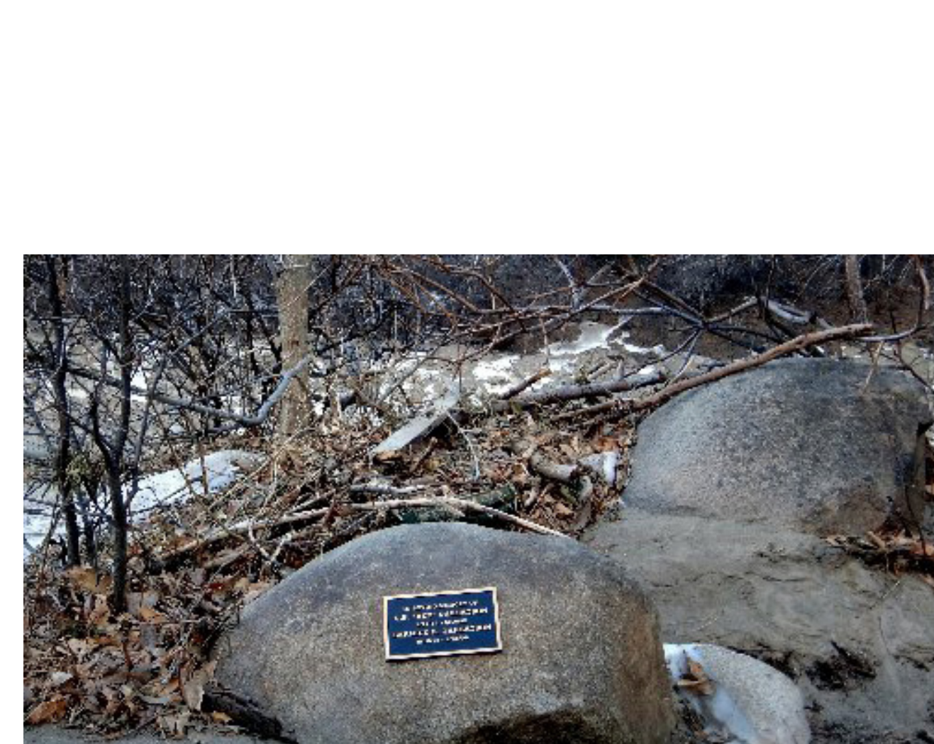
Memorial Plaque and Boulder