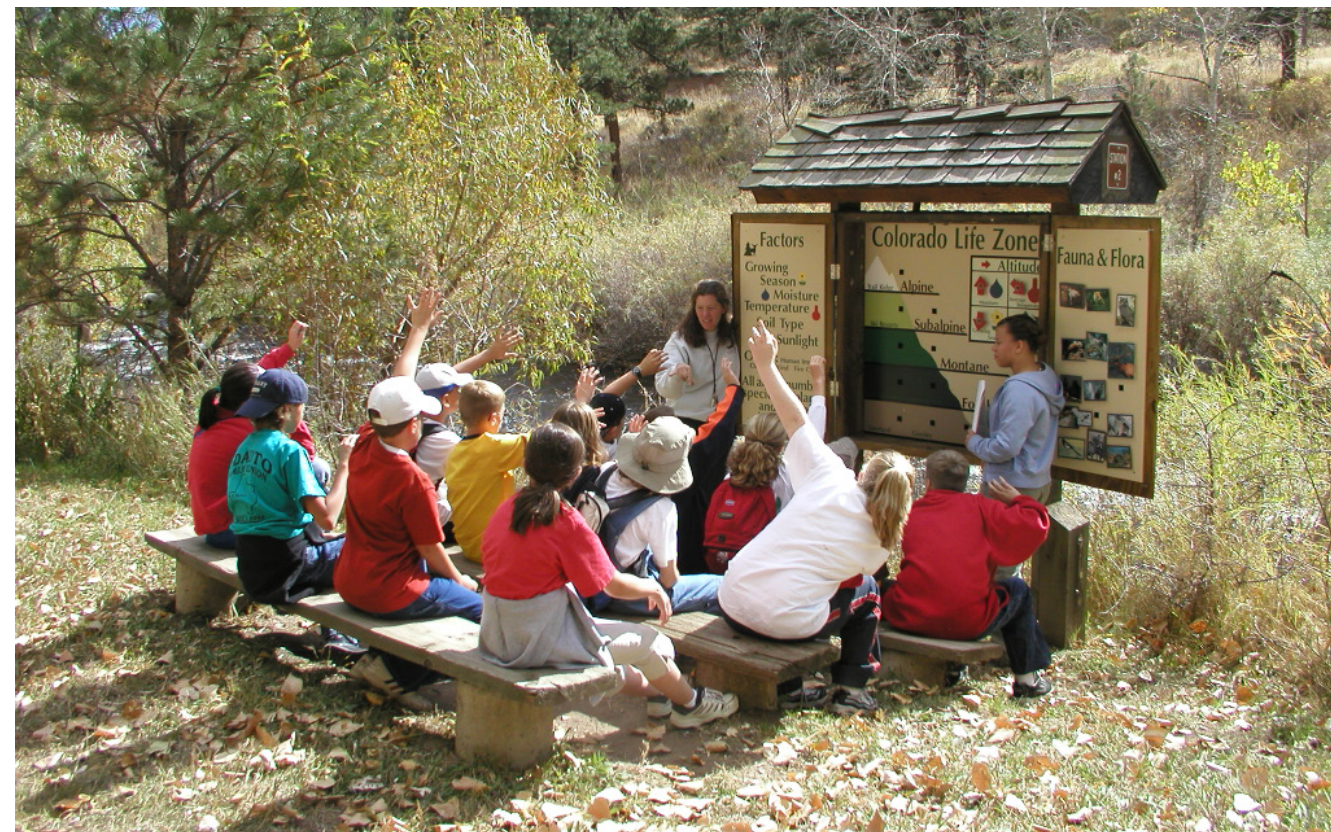
Environmental Education Station within the Park

Loveland's environmental education program initially started with 5th grade school groups. It has since grown to include programs for preschoolers through middle schoolers and the public for all ages with a variety of interests. Programs for the public will start in Spring 2019 and the wildlife program for school groups will resume in 2020.