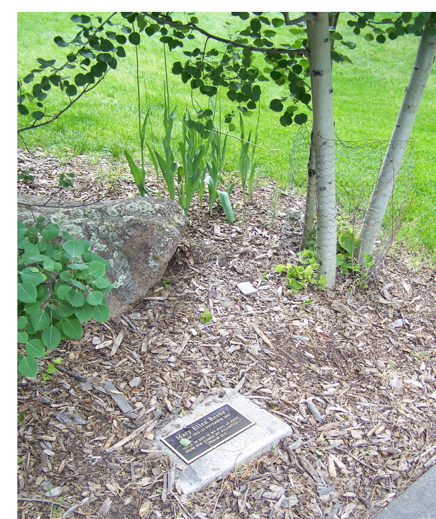
Memorial Plaque and Tree

VSMP has profound sentimental value within the community. Between 1976 and 2013, VSMP collected more than 50 individual memorial plaques with dedicated trees or benches, the majority of which were washed away during the 2013 Flood. The City is working with Art in Public Places to develop a feature that honors the memorials with an anticipated completion date of spring 2020. The City is also considering dedicating space for marriage ceremonies and renewed vows when funding becomes available.