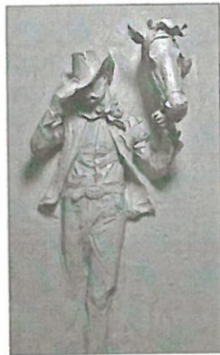
Into the Wind by Craig Campbell