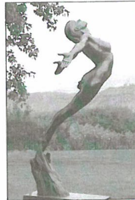
Freedom by Victor Issa