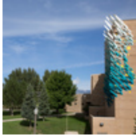
Reflection Aluminum 40' x 40' x 4' $300000.00 2016