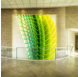
Quill Motion Colored Aluminum 40' x 18' x 5' $200000.00 2013