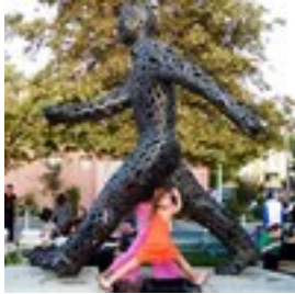
Astride-Aside 1 Bronze 17' x 12' x 4' $130000.00 2003