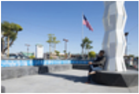
Of Two Lineages 3 Steel, concrete, powder- coated steel image panels 20' x 35' x 35' $200000.00 2017