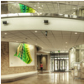
Quill Motion Colored Aluminum 40' x 18' x 5' $200000.00 2013