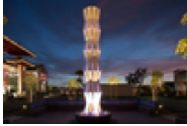
Four Faces 1 Bronze 7' x 7' x 4" $350000.00 2013