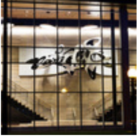
Super Nova Aluminum 14' x 25' x 4' $150000.00 2015