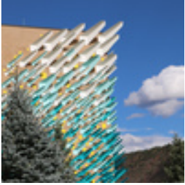
Reflection Aluminum 40' x 40' x 4' $300000.00 2016