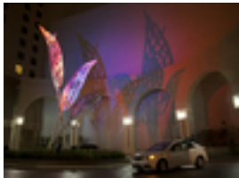
Diaphanous Grove 2 Bronze, hot rolled steel, stainless steel 8' x 31' x .25" $75000.00 2011