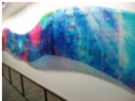
Vision of Color Archtechtural Art glass, Stainless Steel 8' x 20' x 5' $300000.00 2012