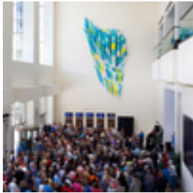
Distortion Aluminum 38' x 25' x 5' $100000.00 2013