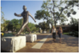
Pneumatic Dreamer 2 Bronze 8' x 14' x 30' $368000.00 2000