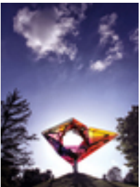
Open Wall Hand Made Venetian murano glass 6' x 58' x 2' $780000.00 2009