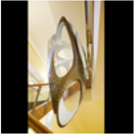
SubDivision Anodized Aluminium 12" x 4" x 8" $41000.00 2012