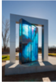
Open Door Stainless steel and translucent architectural art glass 15' x 8' x 2' $275000.00 2015