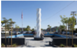
Of Two Lineages 2 Steel, concrete, powder- coated steel image panels 20' x 35' x 35' $200000.00 2017