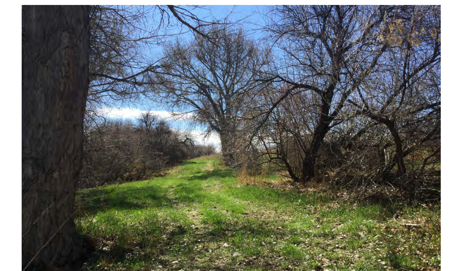
Build east Big Thompson River trail connecting new E. 1st St. Natural Area to Old St. Louis Natural Area