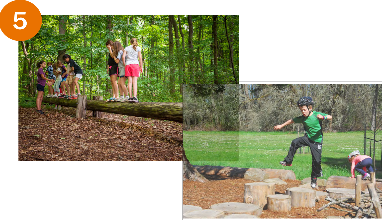
Nature Play Area