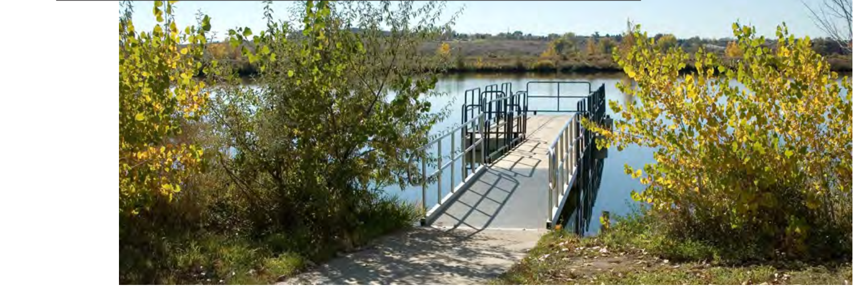
Fishing Dock and Shoreline Access