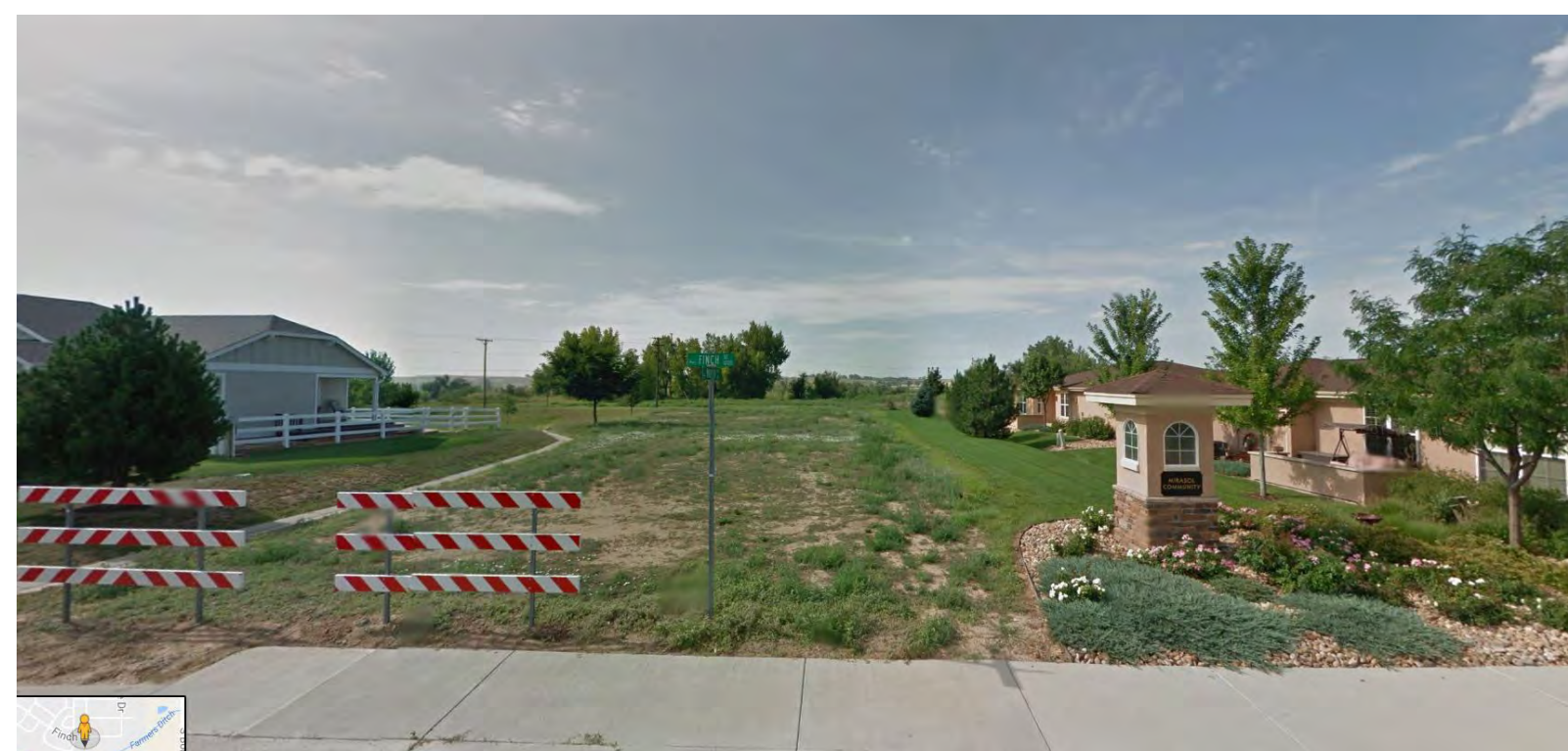
Build Madison Ave. trail connection to Big Thompson River corridor and Old St. Louis Natural Area