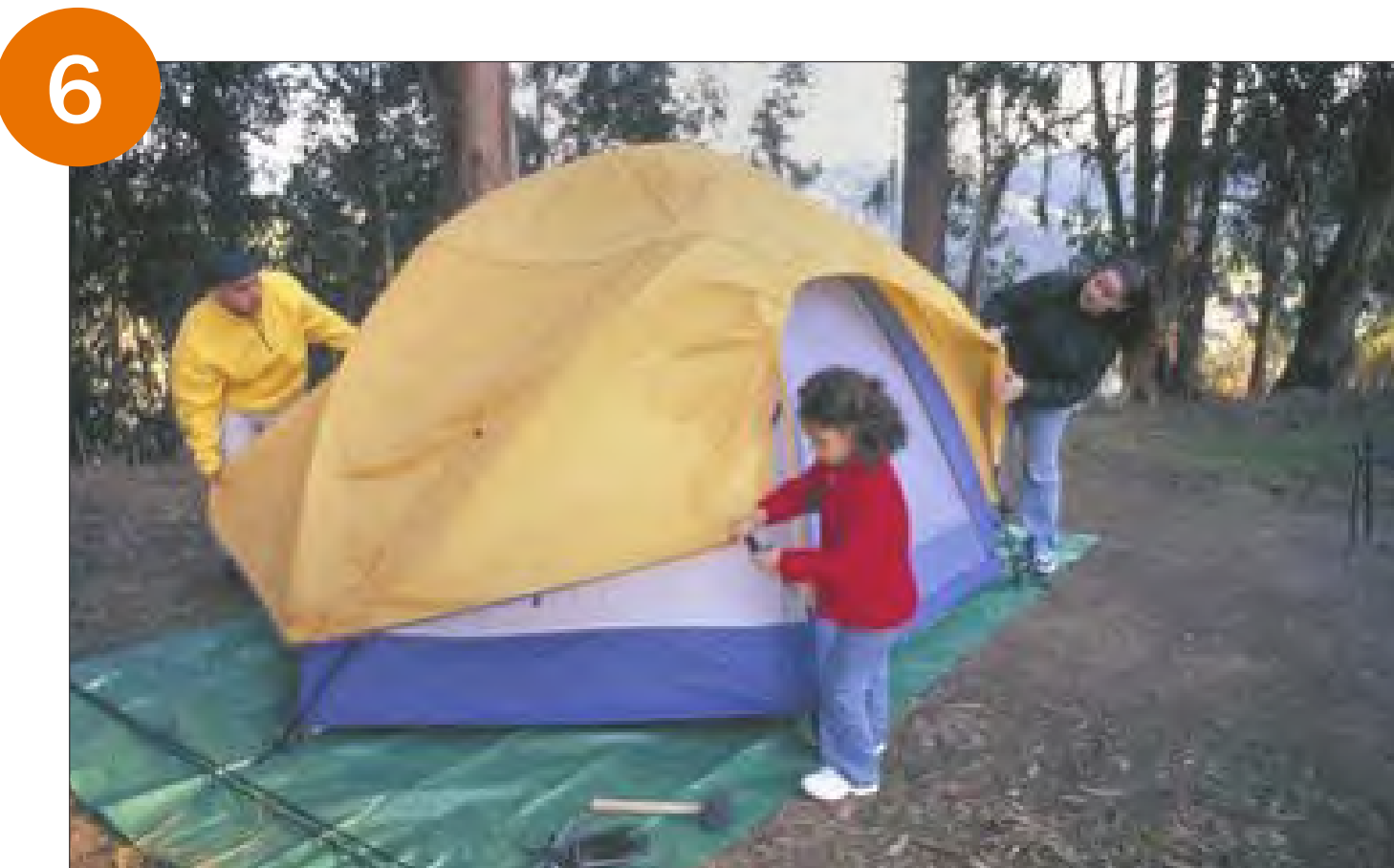
Learn to Camp Area