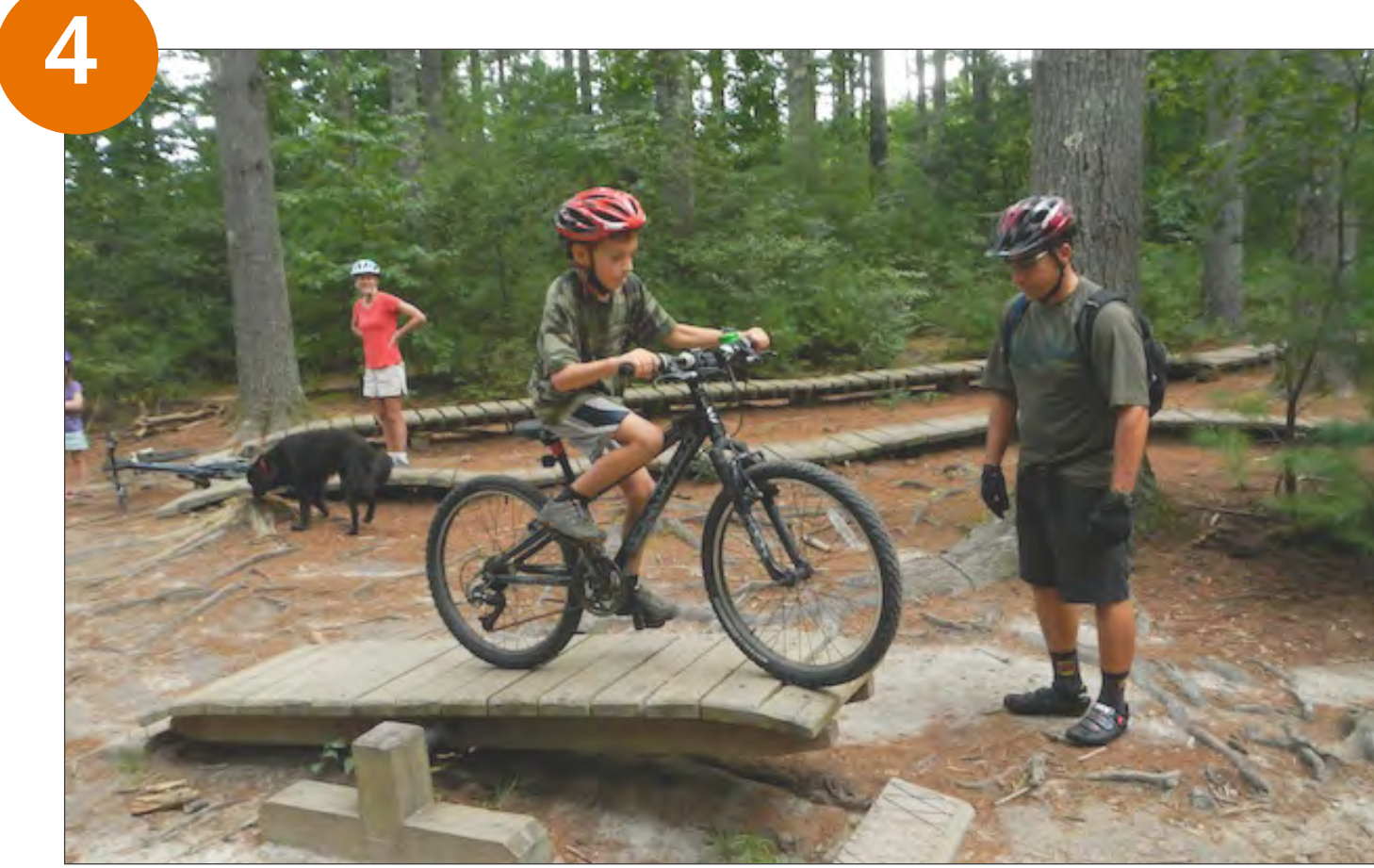
Bike Skills Features