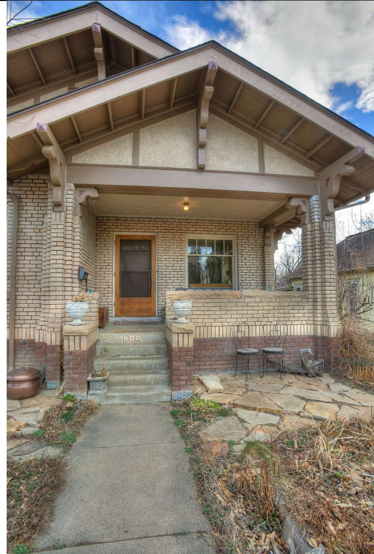
Porch: West Elevation