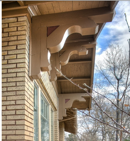
Knee braces. These triangular supports are a structural alternative to exposed rafter tails and roof beams. Like beams and rafter tails, they are often decorative