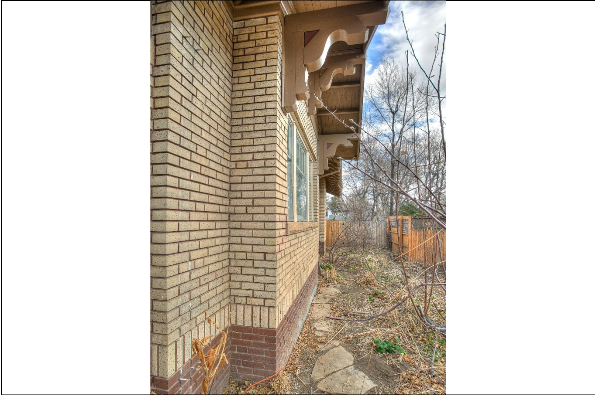
South Elevation showing knee braces