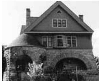
Photos 1 and 2: Examples of shingle style structures.