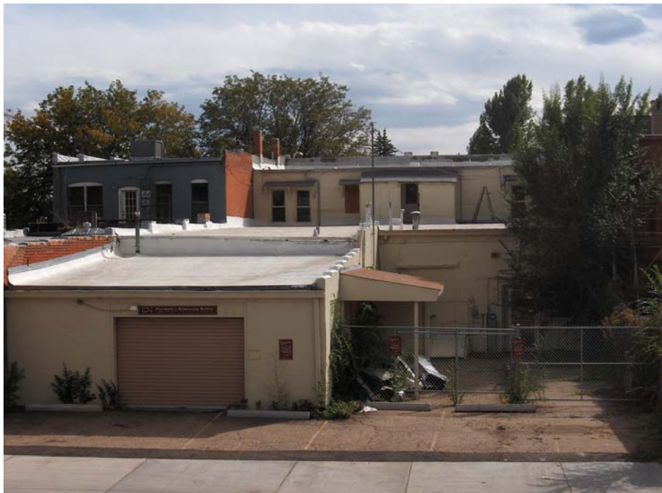
North elevation (rear)

NOTE: Because this building has shared walls to the east and west, these two elevations are not visible.