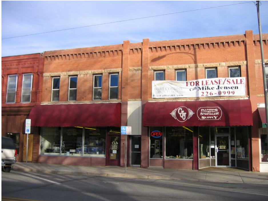
South elevation (façade)