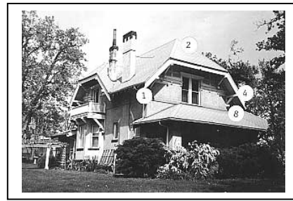
Photo # 1 & #2. Examples of Craftsman Style.

The Swan House was constructed circa 1908 on the north side of E. 6th Street, near the center of the block between Lincoln and Jefferson Avenues. The property, which also includes a former garage and storage shed, is located in a traditionally residential neighborhood northeast of downtown Loveland. The 1½ story Craftsman-style wood-frame house features a rectangular plan, and is supported by a coursed sandstone over brick foundation.