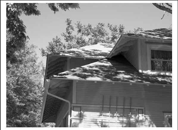
Photo #4. Wide overhanging eaves are featured on the main hipped-roof, and dormers.