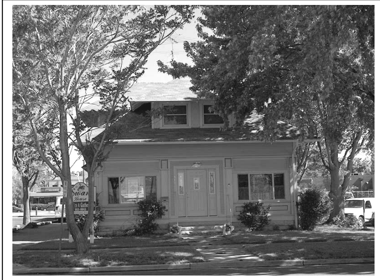
Photo #6. Front elevation with squared columns and enclosed front porch.

All of the home's windows have painted beige wood frames and surrounds. Windows on the building's east elevation include a single-light fixed-pane window, a boxed bay with two 1/1 double-hung sash windows, a single 1/1 double-hung sash window, and another boxed bay with two 1/1 double-hung sash windows. Windows on the west elevation include a boxed bay with a large 1/1 double-hung sash window, another boxed bay with one 1/1 double-hung sash window flanked by two narrow 1/1 double-hung windows, and one single 1/1 double-hung sash windows. See Photo #7.