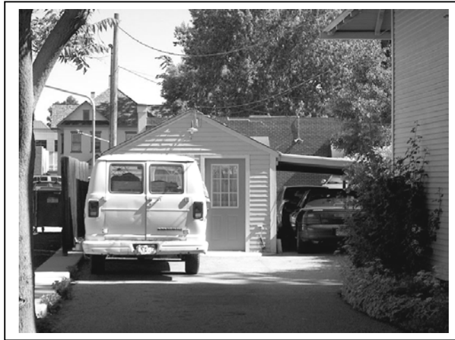
Photo #8. Former garage located at the northwest corner of the property.

south by 12-feet east-west. It has a wood timbers on grade foundation, and painted white horizontal exterior wood siding. See Photo #8.