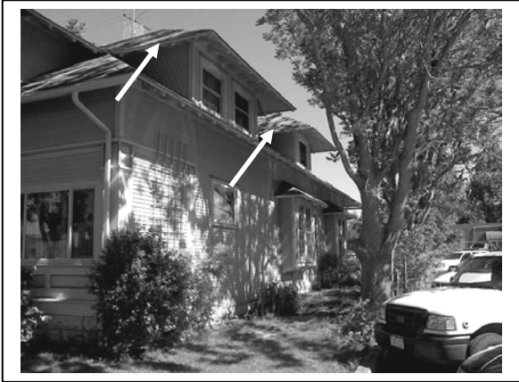
Photo #3. Two of six hipped-roof dormers. These are located on the east elevation.

west end of the north (rear) elevation which comprises an enclosed rear porch and is clad with bead board. The dwelling is covered by a moderately-pitched hipped roof, covered with black asphalt composition shingles. Decoratively sculptured wood rafter ends are exposed beneath wide overhanging eaves, and there are two red brick chimneys on the roof ridge. There is a total of six hipped-roof dormers, including one on the facade, two each on the east and west elevations, and one on the north elevation. See Photo #3, Photo #4 and Photo #5.