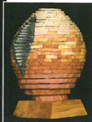
Tom Herzog "Seed Pod Cairn"