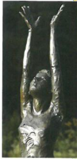
Jane DeDecker "Tree"

5. Rising Rainbow by David Turner. Description: Bronze rainbow trout. Note: Tail support will be reinforced with steel rods inside the bronze.