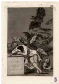
The Sleep of Reason Produces Monsters, 1799. F. Goya.

This exhibition features an early first edition of Los Caprichos, a set of 80 etchings by Spanish artist Francisco de Goya y Lucientes that was published in 1799. Admission: $5, free for Museum members.